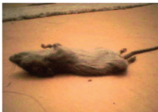
Mouse injected with both heat-killed S strain and live non-virulent R strain dies.

Figure 14.3 Two strains of S. pneumoniae were used in Griffith's transformation experiments. The R strain is non-pathogenic, whereas the S strain is pathogenic and causes death. When Griffith injected a mouse with the heat-killed S strain and a live R strain, the mouse died. The S strain was recovered from the dead mouse. Griffith concluded that something had passed from the heat-killed S strain to the R strain, transforming the R strain into the S strain in the process. (credit "living mouse": modification of work by NIH; credit "dead mouse": modification of work by Sarah Marriage)