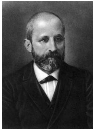
Figure 14.2 Friedrich Miescher (1844–1895) discovered nucleic acids.

Our current understanding of DNA began with the discovery of nucleic acids followed by the development of the double-helix model. In the 1860s, Friedrich Miescher ( Figure 14.2 ), a physician by profession, isolated phosphate-rich chemicals from white blood cells (leukocytes). He named these chemicals (which would eventually be known as DNA) nuclein because they were isolated from the nuclei of the cells.