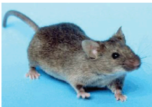
Mouse injected with heat-killed virulent S strain lives.